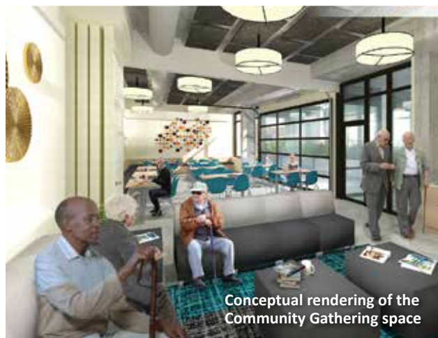
Conceptual rendering of the Community Gathering space

Located on Broadway between Pike & Pine in the heart of Capitol Hill, GenPride has partnered with Community Roots Housing to build Washington state's first affordable housing focused on LGBTQIA+ seniors. With 118 studio and one-bedroom units in an eight-story building, this central location will plant a stake in the ground of what is the historical home of our community.